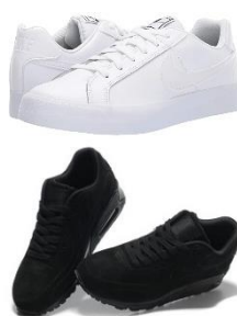
Solid black or white athletic shoes/laces/soles