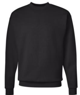
Solid crewneck in white/black/gray may be worn over collared shirt (NO LOGO)