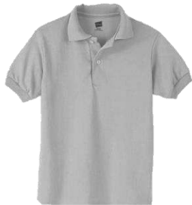
Solid gray polo shirt with collar, long or short sleeved (NO LOGO)