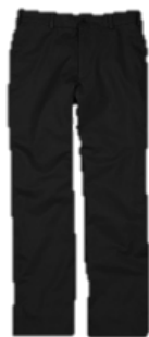
Solid black pants, jeans, leggings or shorts that cover the knee, no sweatpants